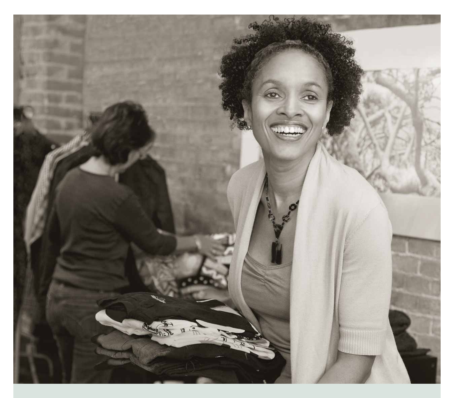
You've spent years building your business and, in the process, you've created a legacy. Now it's time to realize that legacy to its fullest.